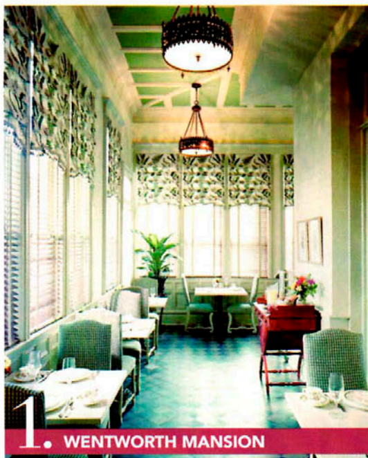
1. WENTWORTH MANSION

Planters Inn A luxury boutique hotel known for its spacious, elegantly appointed rooms and its top-notch restaurant, the Peninsula Grill. 112 North