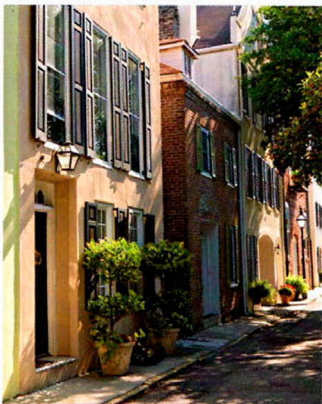
SOUTH OF BROAD