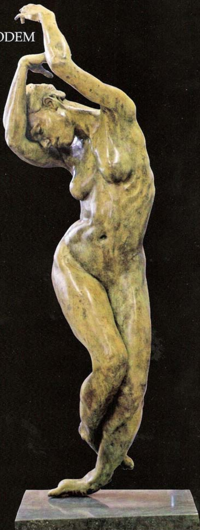
LA MARIONETTA, BRONZE