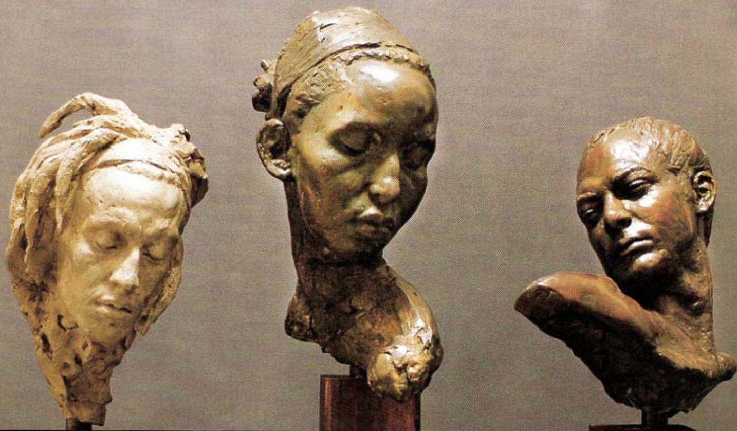
FROM LEFT: THE JESTER, BRONZE, 22 X 10 X 10," ANYAN, BRONZE, 23 1/2 X 10 X 10", RAMIRO, 15 X 13 X 6 1/2"