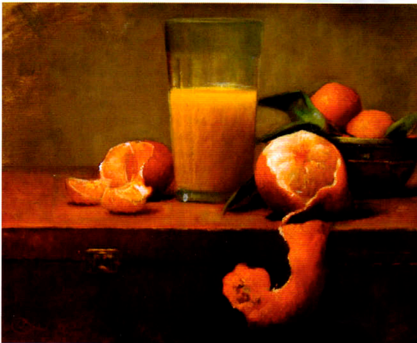
JURA BEDIC, VITAMIN C, OIL ON PANEL, 9¼ X 11½"