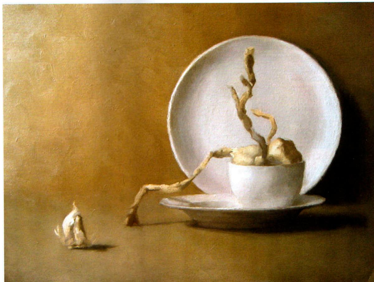
SOFIA ALETHE ROMARK, GARLIC COMPOSITION, OIL ON PANEL, 11 \frac{3}{4} X 15 \frac{3}{4} "