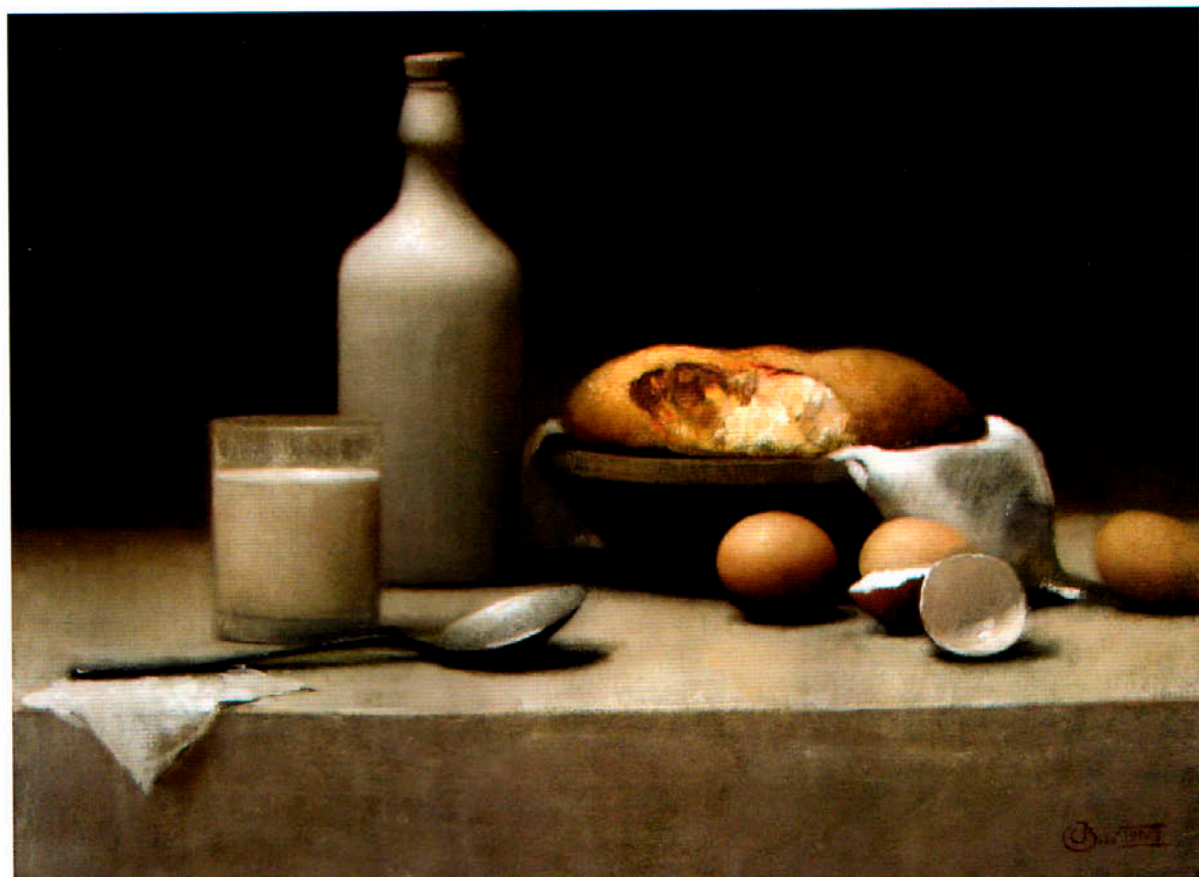
JURA BEDIC, EGGS AND MILK, OIL ON PANEL, 11 \frac{3}{4} X 15 \frac{3}{4} "