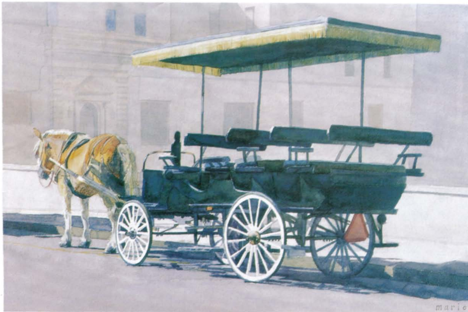
GHOST TOWN, WATERCOLOR, 14 X 20"

The term "Ghosts of Charleston" is used to describe the dark past of Charleston, South Carolina. The ghost of slavery is said to manifest itself on quaint cobblestone Chalmers Street, where the Old Slave mart still stands. The carriage depicted in this painting was parked next to that Slave Mart. I edited out all of the tourists, automobiles and street signs to enhance the town's haunting mood.