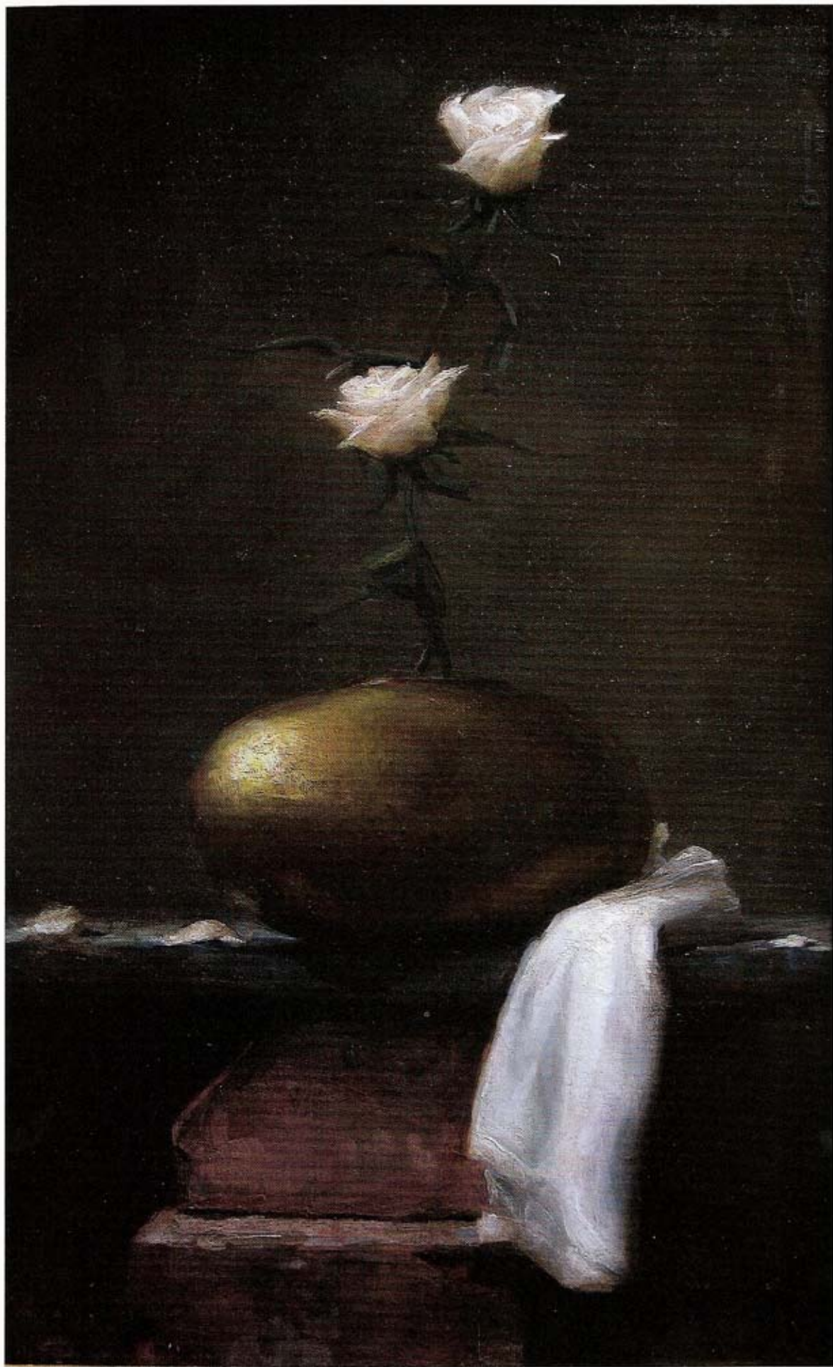
ALLEGORY, OIL ON PANEL, 32 X 28"