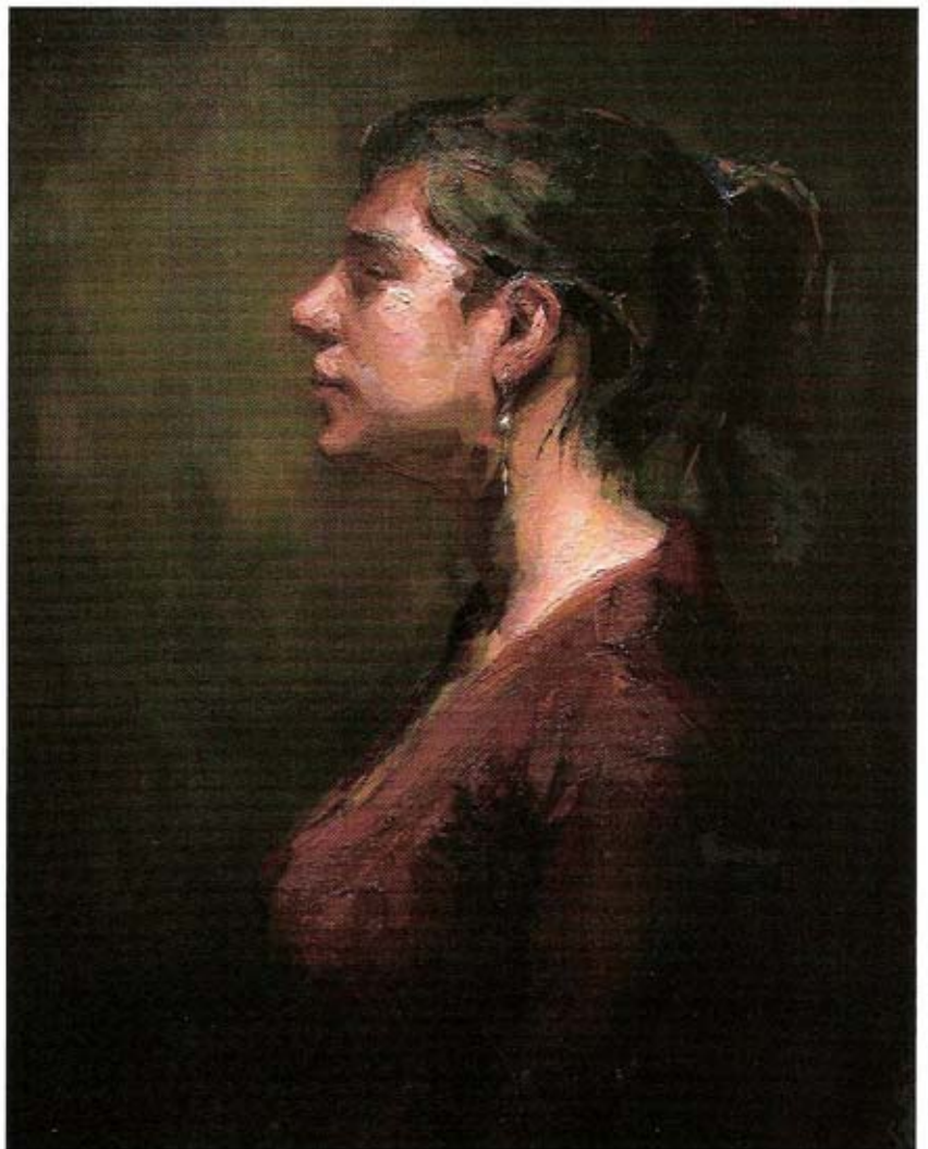
PORTRAIT OF YOUNG ARTIST, OIL ON LINEN, 18 X 24"